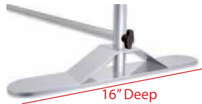
Sturdy Steel "Bridge" Support Base