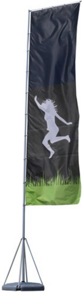
Double Sided Graphic Available