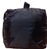
Optional Sand Bag