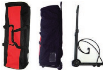
*Package includes padded nylon travel bag