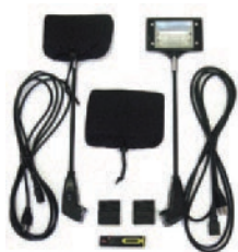
*Optional 200 watt halogen lights