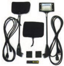
*Optional 200watt halogen lights