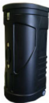
Half Hard Case is optional.