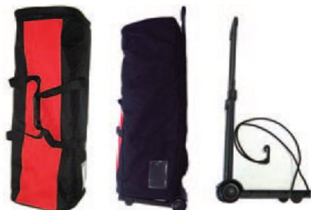
*Package includes padded nylon travel bag