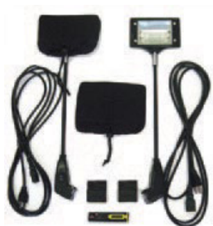
*Optional 200 watt halogen lights

Anodized finish is an ideal eye-catcher for your trade show or exhibition