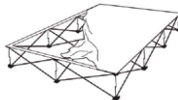
3 Working in a continuous direction around the frame, attach the rest of the graphic. Make sure the graphic is pulled taut while attaching the velcro.