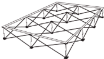
1 Assemble frame and lay flat on its back. Remove existing graphic.