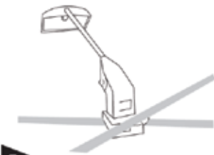
5 OPTIONAL Attach lights to top of frame by sliding the plastic "x blocks" under the frames cross sections.

Warning: To avoid damage, separate end caps & disconnect ALL hooks before collapsing the frame.