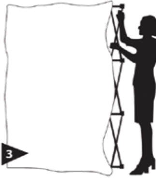
3 Lock all hooks between front and back hubs.