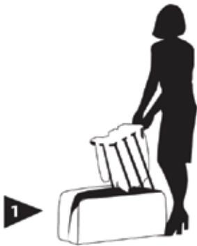
1 Remove frame and graphic from nylon bag.