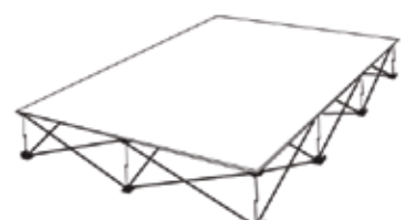
4 If needed, adjust velcro for taut fit.