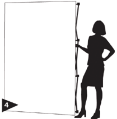
4 Adjust leveling feet for desired angle. Ready pop display can now easily be moved into position.