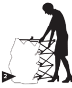
2 Ensure "adjustable feet" of frame are on the floor. Pull up display into upright position.