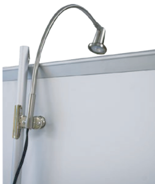
* Optional Lumina Light