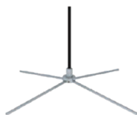
(X) Base Options