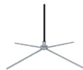
(X) Base Options